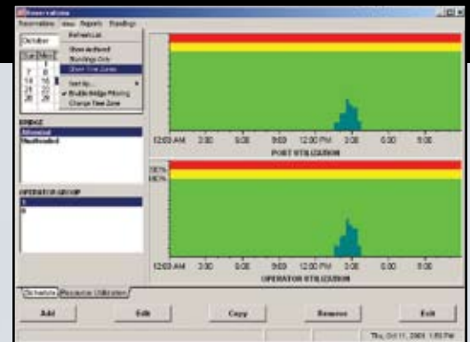
View operator and equipment utilization